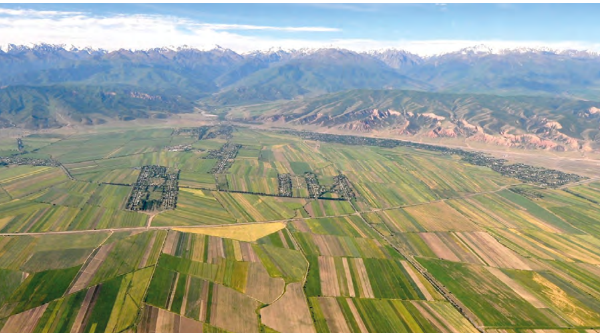
Water from the Tian Shan mountains is an indispensable resource for agriculture in the lower-lying steppes and for hydropower production in the Kyrgyz Republic.