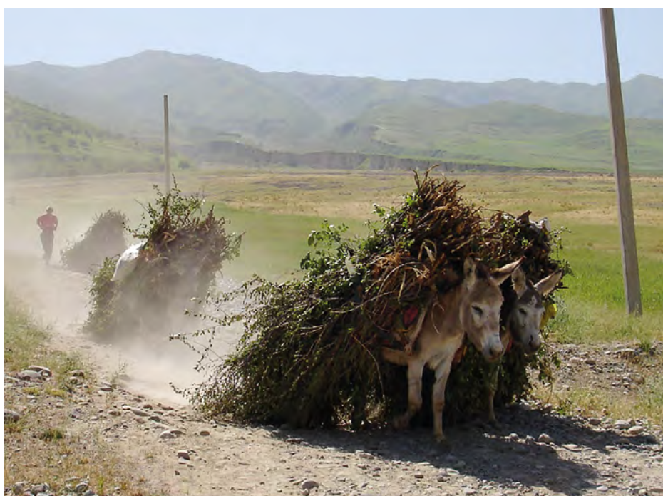
Fuelwood collection in Tajikistan. (R. Fleiner)

Vulnerability to food security is increasing: By 2012, almost 45 percent of rural mountain communities in developing countries were assessed as vulnerable to hunger and malnutrition – up from 38 percent in 2000. Hunger and