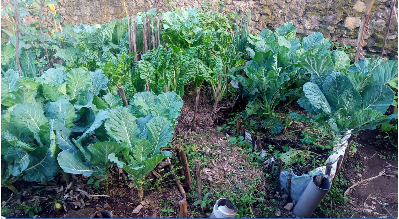
Harvesting from the PIP kitchen garden to boast household nutritional diet