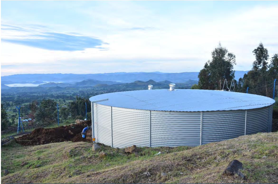
(above) Buzeyi park reservoir that supplies Muramba subcounty and (below) the Public stand post fenced by the water users,