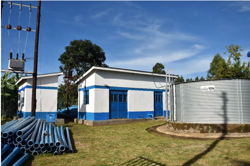
(above) Bukara Boaster station pump and hydro electricity installation, (below) Buzeyi Boaster station with pumps, generator and hydro electricity installation